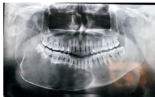
Fig 2 – OPG showing unilocular radiolucency on right side of mandible

The intra-oral examination revealed expansion of buccal cortex. The Orthopantomogram (OPG) revealed a well defined unilocular radiolucency in the mandible extending from left canine region to the sigmoid notch on right side including the lower border (Fig 2).