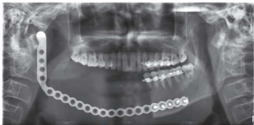
Fig 4 – Post surgical OPG with reconstruction plate

Post operative period was uneventful and after forty five days of follow up, the patient has no complaints.