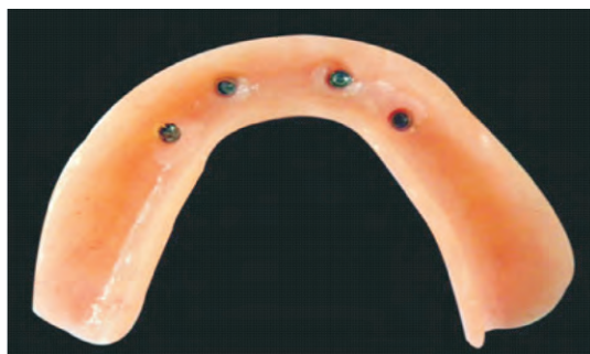
Figure 5 :Intaglio Surface of Mandibular Prosthesis with Metal Encapsulator