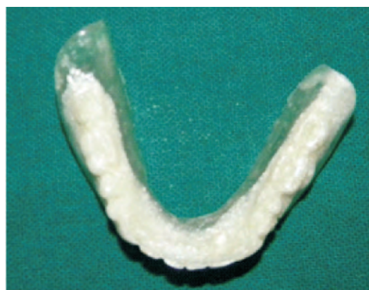
Fig 1 : Radiographic Guide

Conventional complete dentures were fabricated for the patient. Radiographic guide was made by duplicating mandibular denture for the patient in which all the teeth were made from 30% Barium Sulphate powder and 70% Cold cure polymer (Trevalon, Dentsply) 5 .