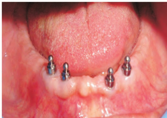
Figure 4 :Dalla Bona Male Attachments

A stage II surgery was performed after eight weeks and Dalla bona male attachments were torqued in at 25 Ncm (Fig 4) .