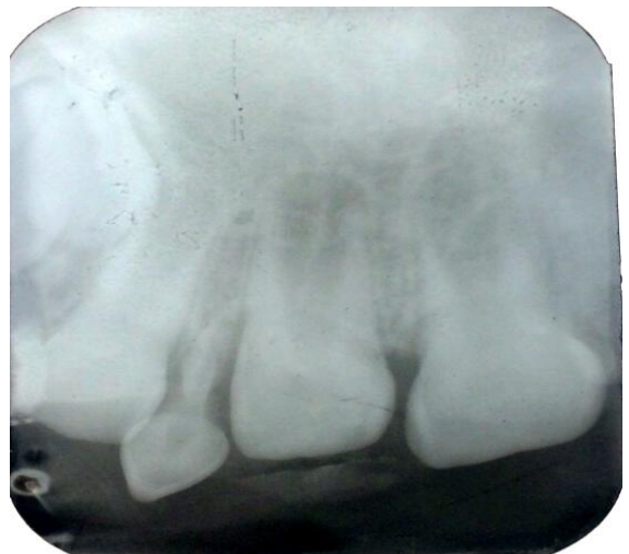
Fig. 3: Intraoral periapical radiograph showing pericoronal shadow of soft tissue covering the erupting tooth and supernumerary tooth