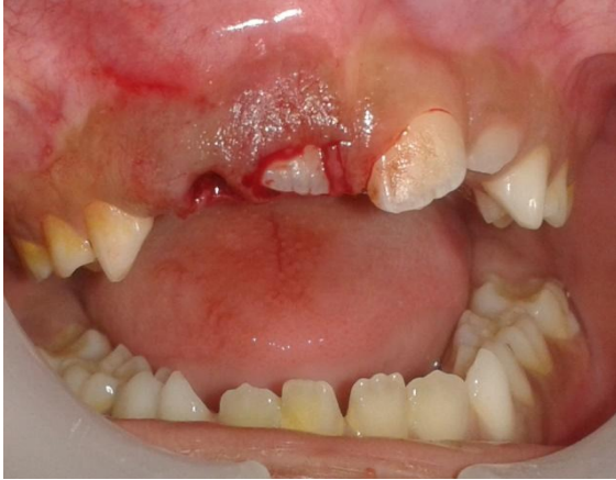
Fig. 5: Surgical exposure was carried out to expose the erupting 11