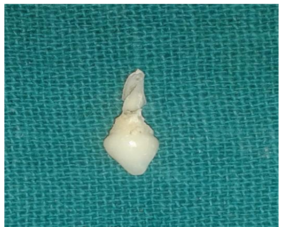
Fig. 4: Extracted supernumerary tooth