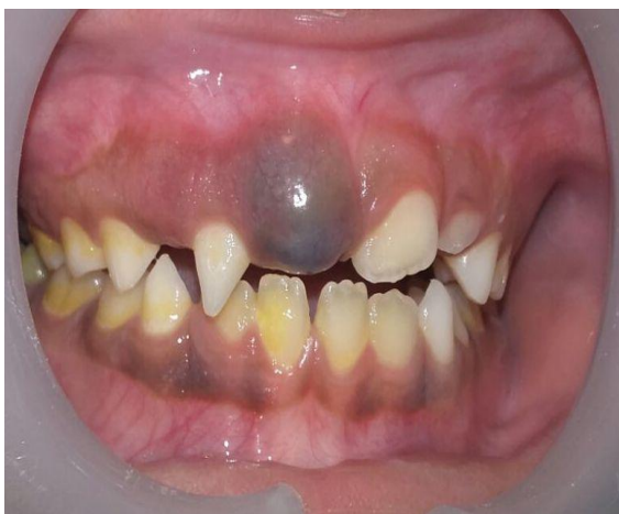
Fig. 1: Intraoral view showing gingival swelling and supernumerary tooth

The histopathological examination showed an inner lining of stratified squamous nonkeratinized epithelium with an underlying connective tissue stroma. The cystic stroma was extremely cellular and showed a moderate chronic inflammatory cell infiltrate. Based on the histopathological findings, a final diagnosis of eruption cyst was made.