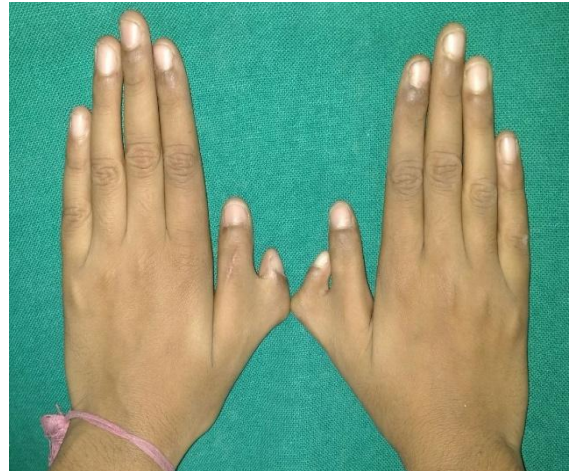
Fig. 2: Both the hands showing polydactyly