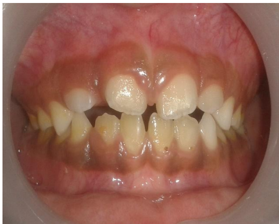
Fig. 6: Post-operative view showing the normal eruption of 11