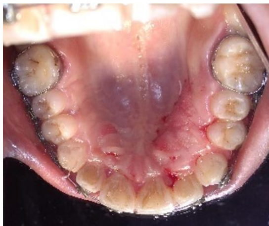
Fig. 10: Post operative view of left maxillary gingiva after 6 months