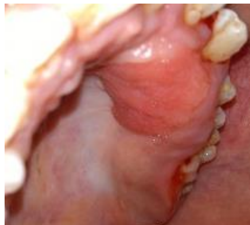
Fig. 3: Enlarged maxillary palatal mucosa showing a erythematous lesion in relation to canine & 1 st premolar