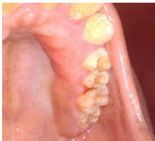
Fig. 8: Post operative view of left maxillary gingiva after one month