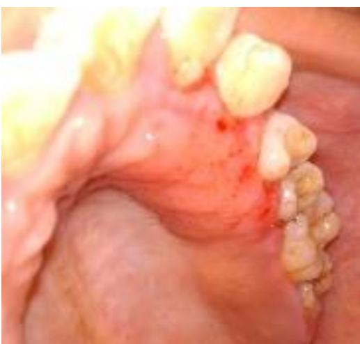
Fig.6: Post operative view palatal aspect of left maxillary gingiva after gingivectomy (after 1 week)