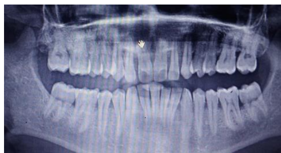
Fig. 4: OPG showing mild bone loss on the left side of the jaw