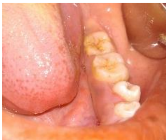
Fig. 9: Post operative view of mandibular gingiva after 1 month