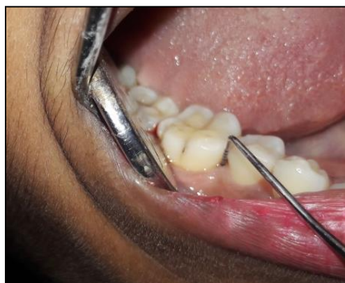
Fig. 1: 4 – 6 mm of probing depth

All the data was collected and analyzed. The statistical analysis was done by statistical software SPSS version 16.0. The descriptive statistic mean and SD of different parameters at different time interval of two groups were calculated, the significance of mean, mean difference of a parameter at 2 intervals was tested by t-test for two independent groups. Since CFU in two groups at pre and post have high standard deviation, so the data for CFU transformed in Logarithm base 10 and log transformed t test has been used. The confidence interval and level of significance were 5% and 95% respectively.