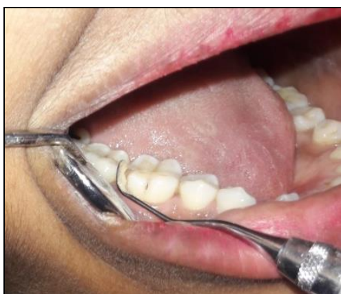
Fig. 2: Collection of plaque sample from the site