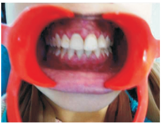
Fig. 1: Red and inflamed gingiva in patient with uncontrolled T1DM.

Oral symptoms were absent in all the patients with T1DM. While examining the hard tissues, dental caries were found in 90% of the patients with uncontrolled T1DM as compared to 40% of the patients with controlled T1DM. During soft tissue examination of patients with T1DM, almost all of uncontrolled T1DM complained of redness, inflammation and bleeding from gums (Fig. 1). Periodontitis was found in 70% of the patients with uncontrolled T1DM and 10% of the patients with controlled T1DM. (Table 2)