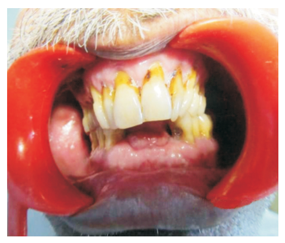
Fig. 2: Periodontitis and missing lower anterior teeth in patient with uncontrolled T2DM.

periodontitis was observed in all the patients with uncontrolled T2DM as compared to 50% of the patients with controlled T2DM (Table 3) (Fig. 2).