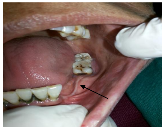
Fig. 2: Intraoral picture showing obliteration of vestibule wrt 35, 36 region