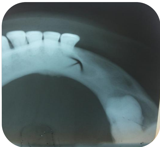
Fig. 4: Mandibular occlusal topographic radiograph which revealed normal anatomic landmarks and missing teeth 33,34,35,36