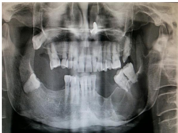
Fig. 5: OPG which showed a well-defined radiolucency was present wrt left lower molar – ramus area which was oval in shape with well-defined corticated borders and internal septae was present giving it a multilocular appearance