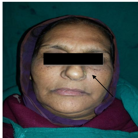
Fig. 1: Extraoral picture showing swelling on left lower side of face

The overall features were suggestive of odontogenic keratocyst. So final diagnosis of odontogenic keratocyst wrt left lower molar – ramus area was given. The patient was followed up after one month and the healing was found to be satisfactory with no tendency for recurrence.