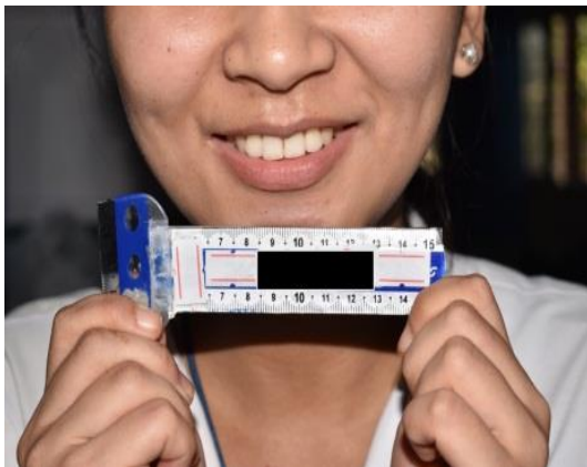
Fig. 1: An example of photograph of the participant during the posed smile, shaded part contains the code number, age and gender of the participant

Parallelism was studied whether incisal edge of maxillary anterior teeth are parallel to upper border of lower lip, or in straight line or in reverse relation. In smile, we also studied whether lower lip touches, does not touch or even covers the incisal edges of maxillary anterior teeth. Number of teeth exposed include whether canines, premolars or molars are seen or not during smile. In assessing the deviation factors (Fig. 2), we checked for presence of midline diastema, multiple gaps, interincisal gap, and canting of upper lip during smile.