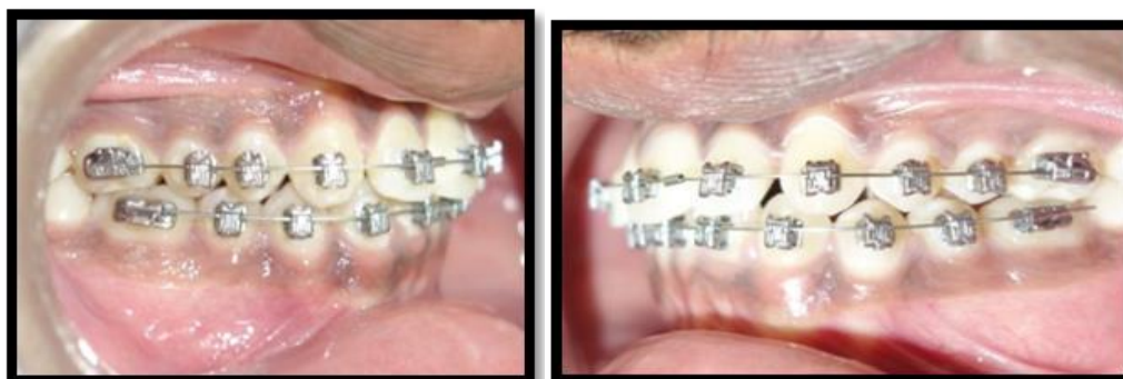
Fig. 3: (a) Showing the placement of molar tube on 1 st molar of upper right quadrant (AO) and lower right quadrant (OO) and (b): Showing the placement of molar tube on 1 st molar of upper left quadrant(OO)lower left quadrant (AO)