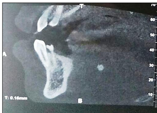
Fig. 2: Sagittal view of CBCT depicting small ovoid shaped radiopacity in right floor of mouth