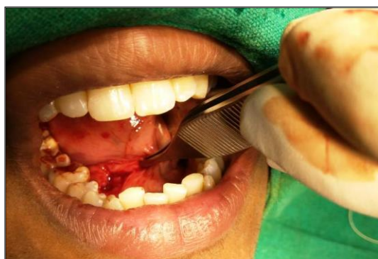
Fig. 4: Surgical procedure