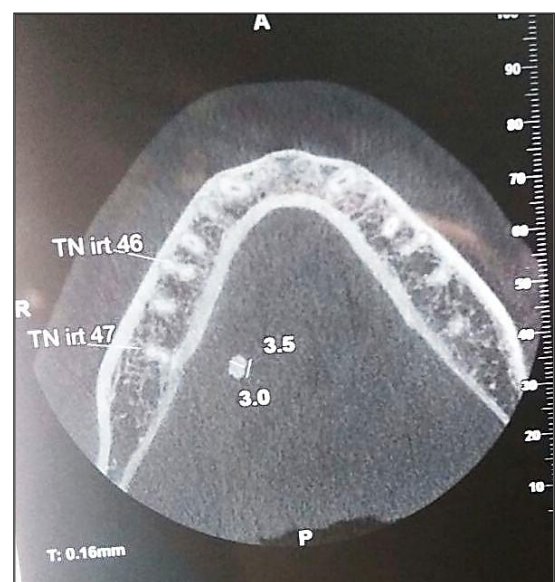
Fig. 1: Axial view of CBCT depicting small ovoid shaped radiopacity in right floor of mouth

discharge or bleeding reported from the site. When the gland was palpated, saliva could be seen at the duct orifice and the gland was tender. Occlusal radiographic examination revealed faint solitary small ovoid radiopaque fleck on the right side. A cone beam computed tomography scan (CBCT) was taken, which confirmed the presence of calculi {Fig. 1, 2, 3 (a), 3(b)}. Based on these findings the patient was diagnosed with a sialolith in the submandibular gland duct. Surgical removal of the sialolith was planned and performed under local anesthesia (Fig. 4). With antibiotic coverage under local anesthesia, incision was placed longitudinally along the margins and was placed at the ductal orifice and calculi was exposed and retrieved. The calculus was removed in total and was followed by a satisfactory healing process. The sialolith was of size 3x 3.5 mm (Fig. 5).